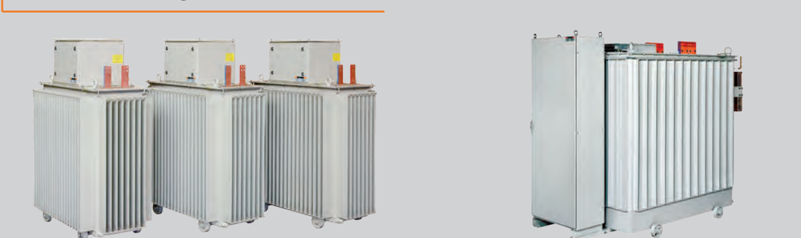
■ Thyristor or variable ratio transformer control