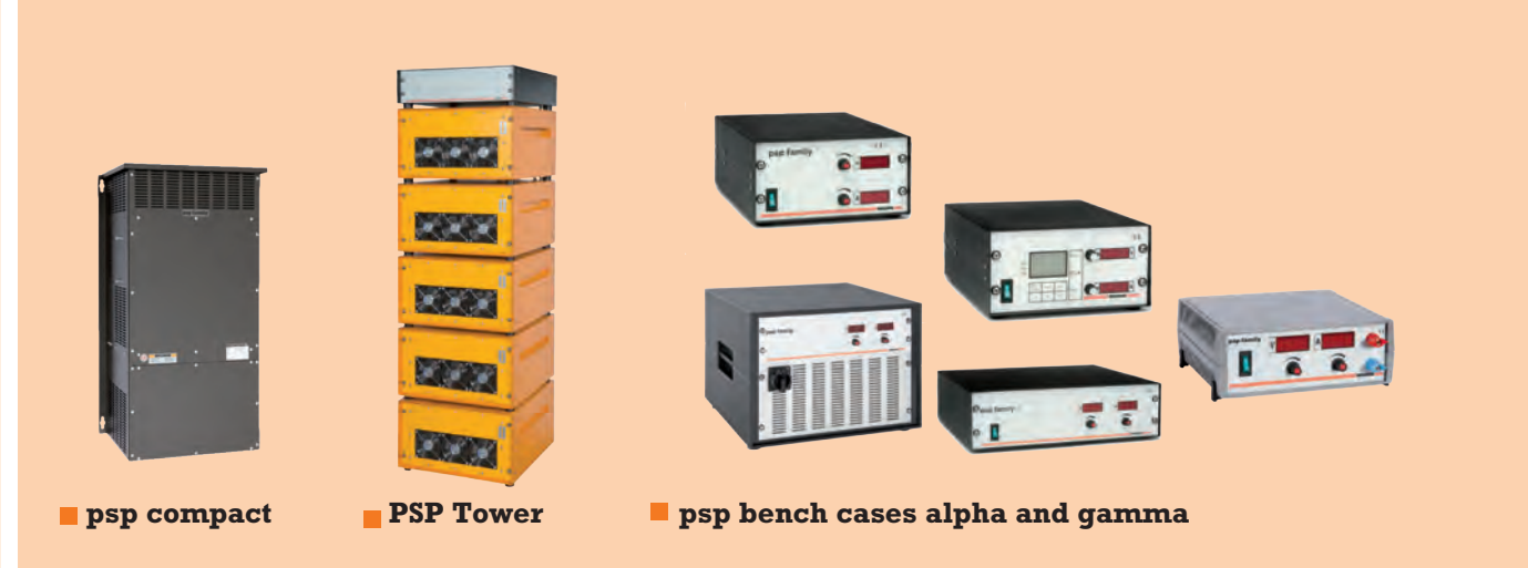
■ psp compact