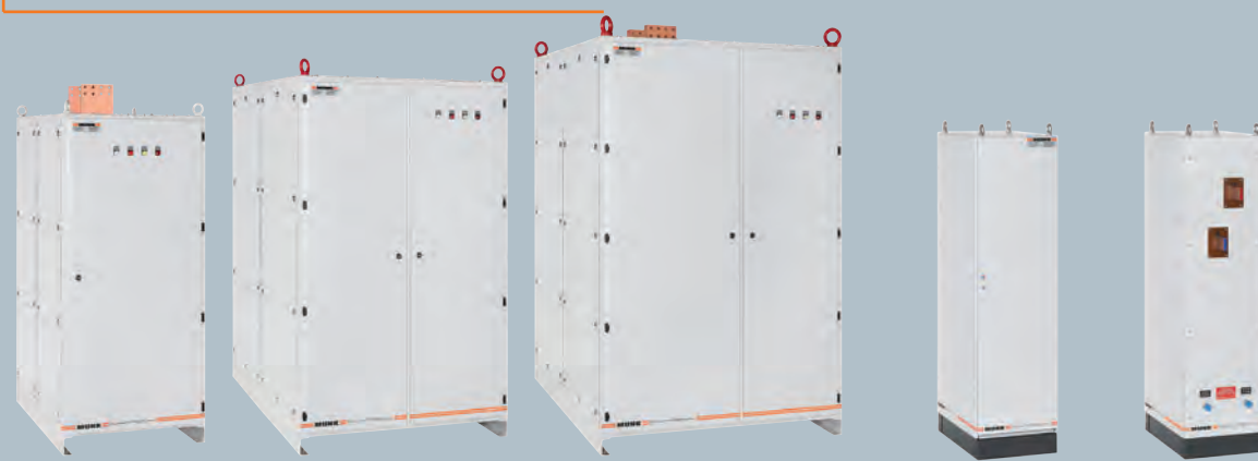
■ Thyristor or switch mode (IGBT) power supply control