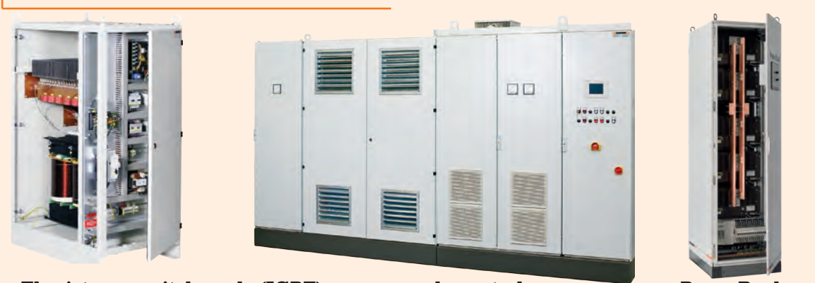
■ Thyristor or switch mode (IGBT) power supply control