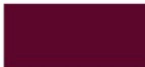
Sanodal Red B3LW 0.5 g/l Sanodure Bronze 2LW 3.0 g/l