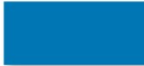
Sanodal Turquoise PLW Liquid 5.0 g/l