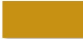
Sanodure Fast Gold L 3.0 g/l