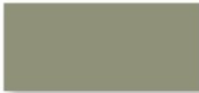
Sanodure Olive Brown 2R 0.1 g/l