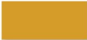
Sanodure Fast Gold L 0.15 g/l Sanodure Fast Bronze L 0.15 g/l