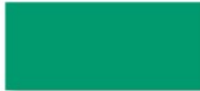
Sanodal Turquoise PLW Liquid 5.0 g/l Sanodye Yellow 3GL 3.0 g/l