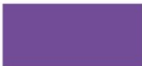
Sanodure Violet CLW 1.2 g/l Sanodye Blue G 0.2 g/l